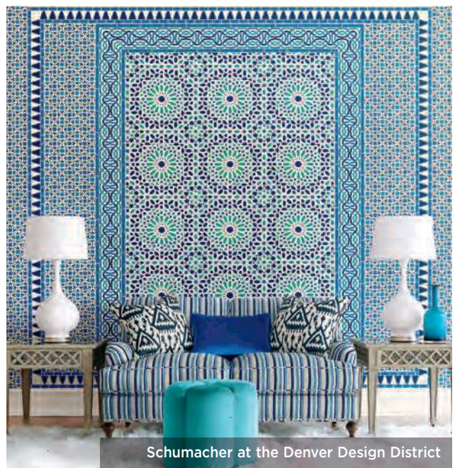
Schumacher at the Denver Design District