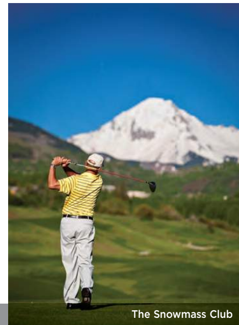
The Snowmass Club