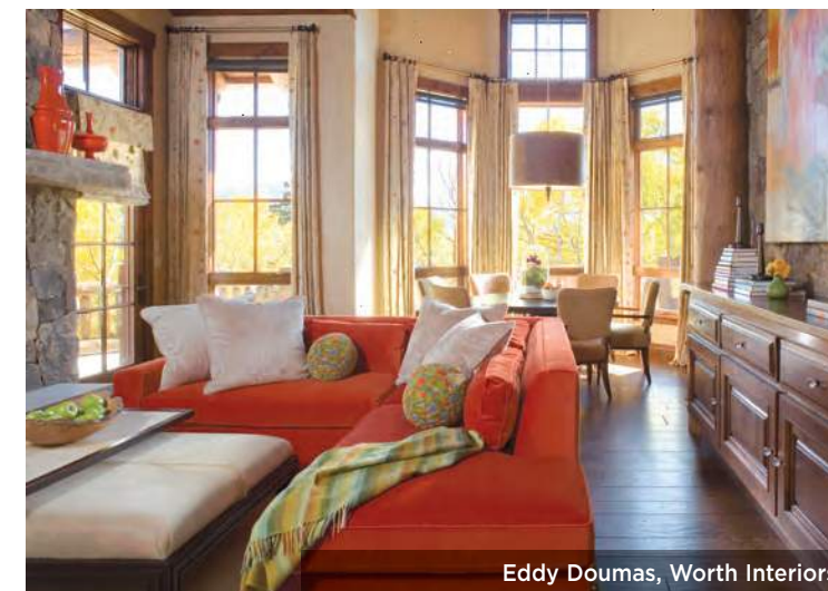
Eddy Doumas, Worth Interiors