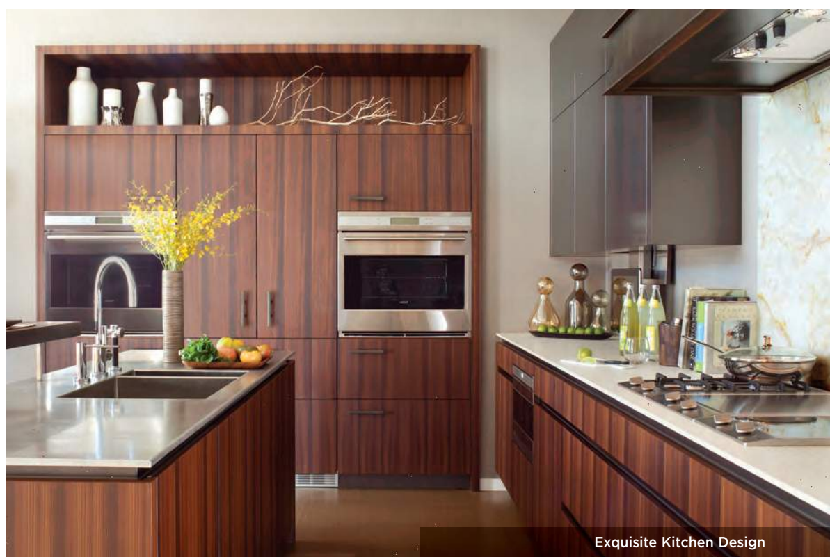
Exquisite Kitchen Design