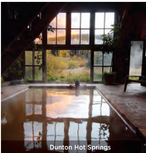
Dunton Hot Springs