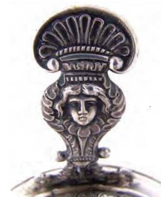
Black Tulip Antiques

Why we love it: These experts may have perfected the art of dealing beautifully old items, but they've stayed up to speed with technology too: the shop's user-friendly website is updated daily and features more than 8,000 items