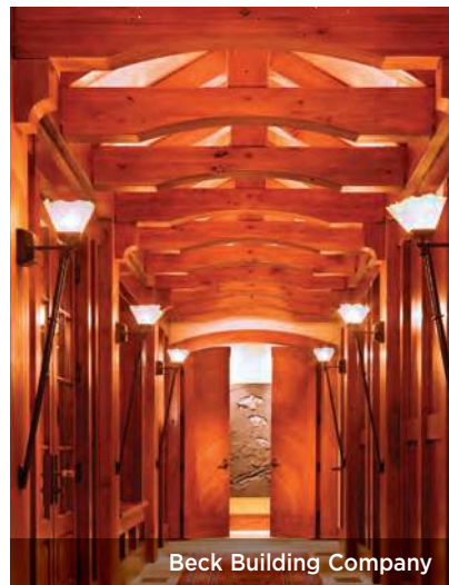
Beck Building Company