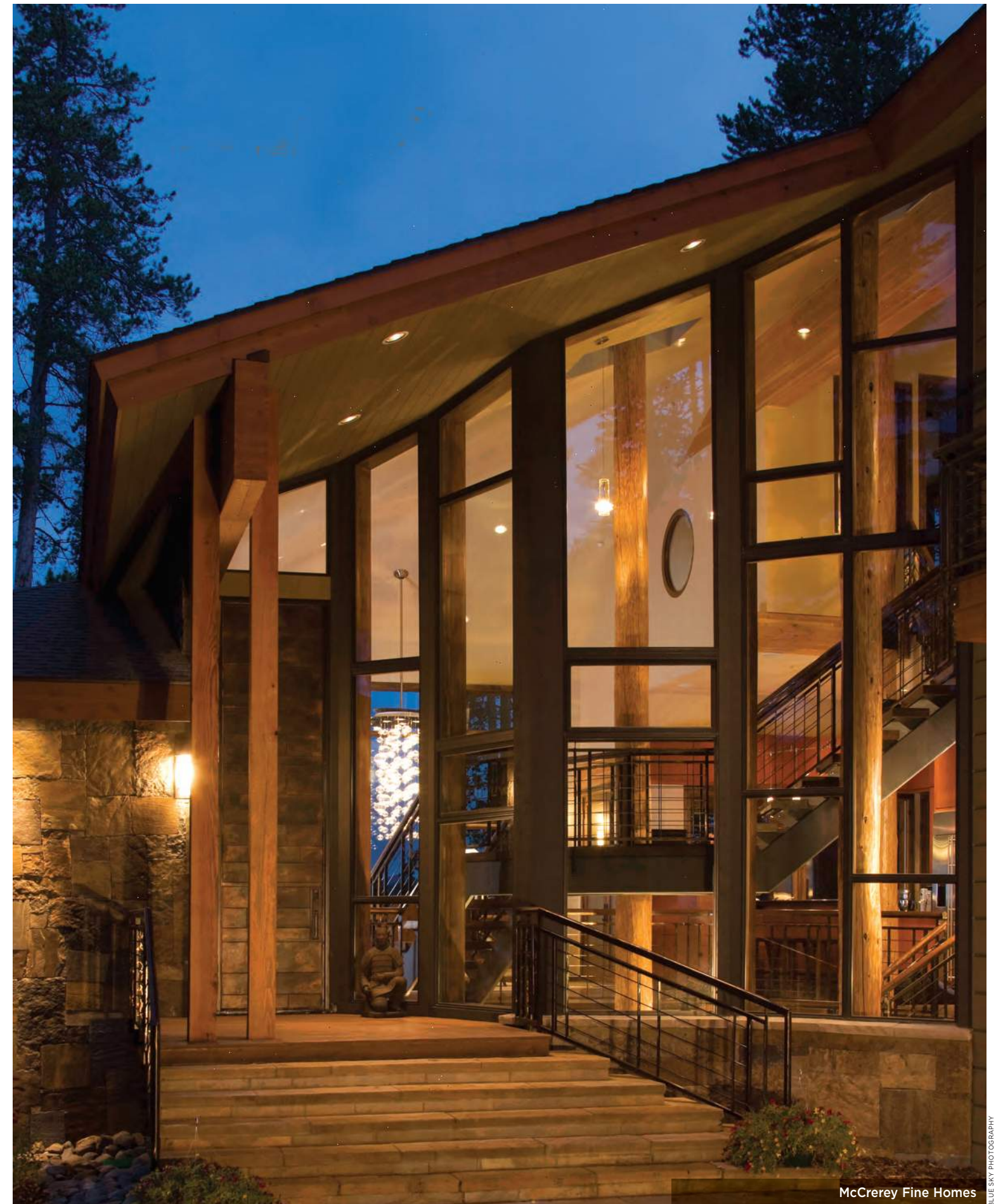
McCrerey Fine Homes

Local factor: One of the first companies in the state to become a certified Built Green builder, McCrerey Fine Homes has been building magnificent, eco-friendly mountain homes since 1976 ▸