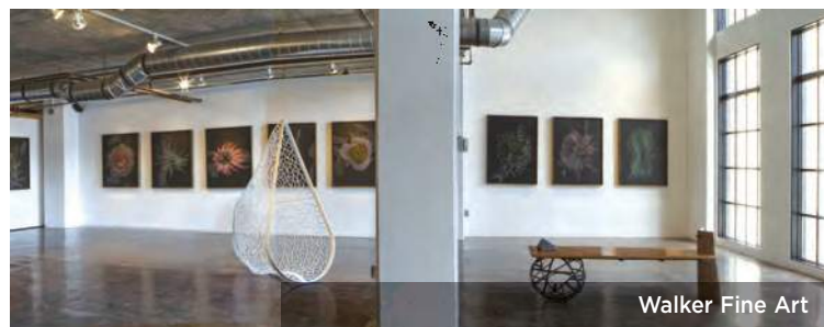
Walker Fine Art

finds plenty of time to help clients create what he calls “the perfect art-centric environment”