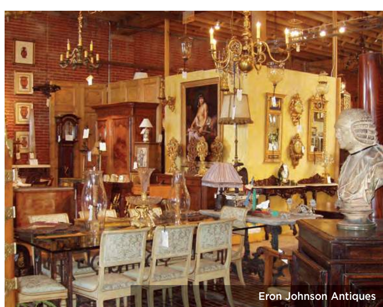
Eron Johnson Antiques

Why we love him: Even though he's the busy owner of an award-winning gallery (nestled in the foothills just west of Littleton), he