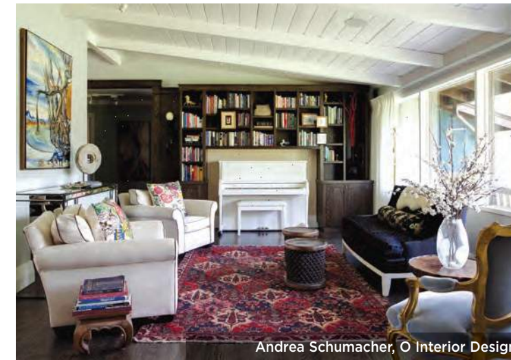
Andrea Schumacher, O Interior Design

Known for: Creative versatility (this inspired crew tackles projects from the city to the mountains); open, spacious floor plans that look as smart as they function; a well-edited aesthetic that borders on minimalism