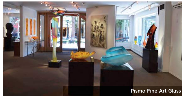
Pismo Fine Art Glass