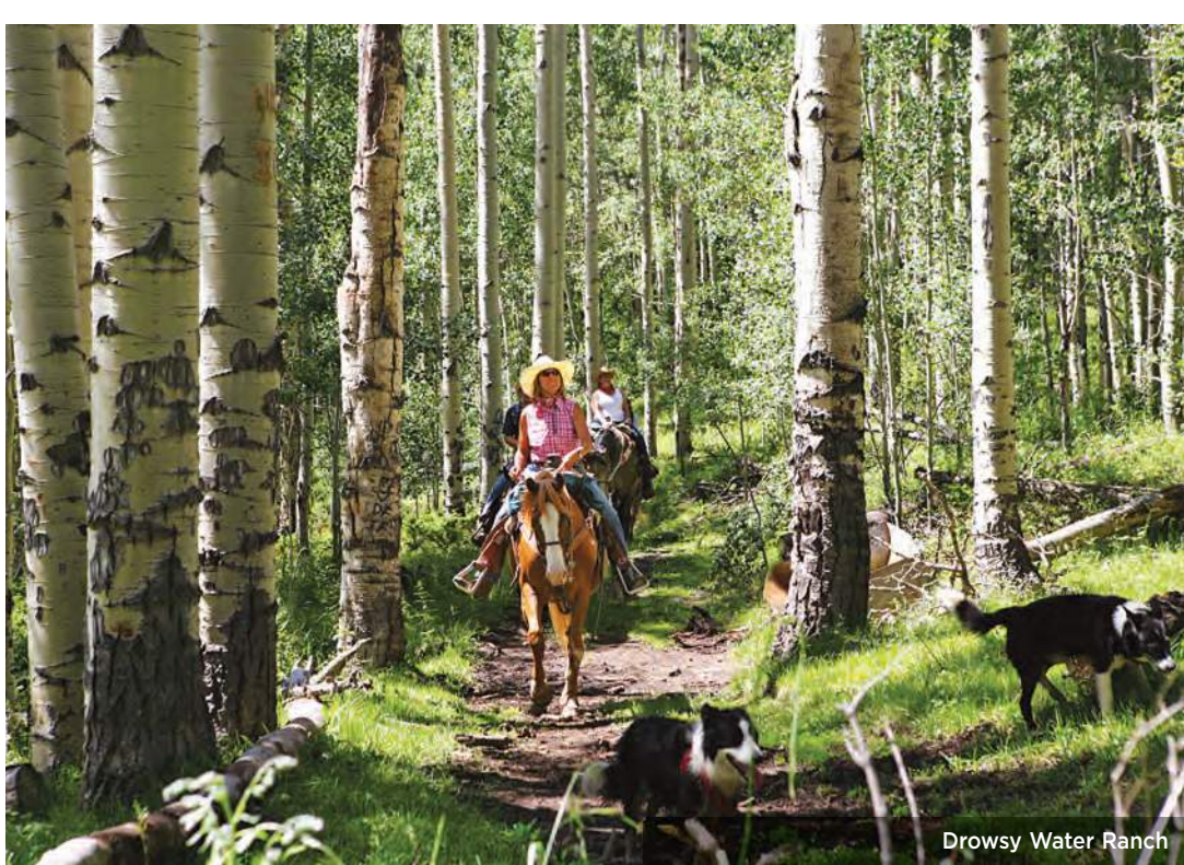
Drowsy Water Ranch