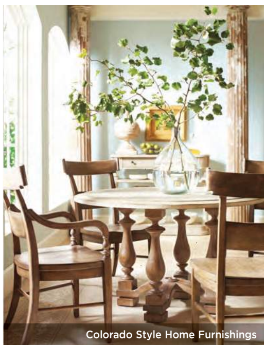
Colorado Style Home Furnishings