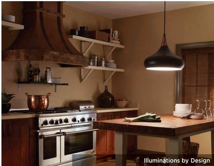
Illuminations by Design