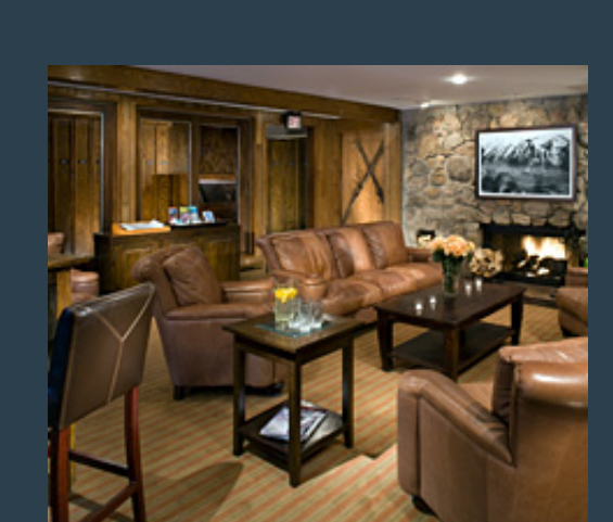
Molly Gibson Lodge – Aspen, Colorado