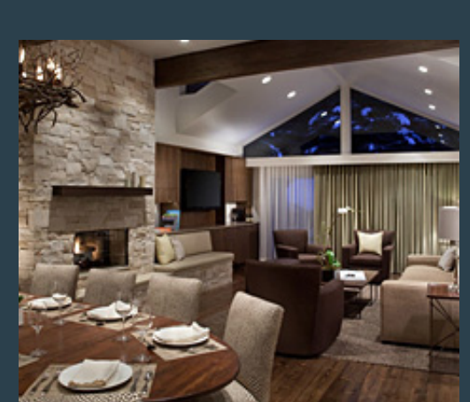
Clarendon 5 – Aspen, Colorado