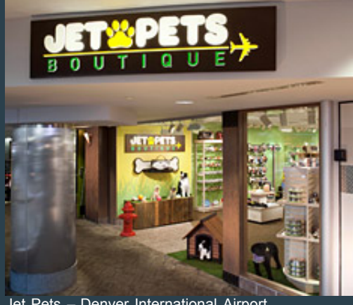
Jet Pets - Denver International Airport