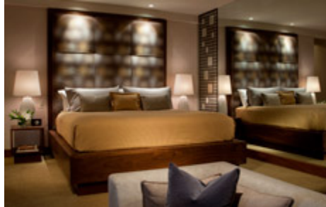
Slope Style Condo — Aspen, Colorado

The design theme of the ski-in, ski-out condo combines urban flare with mountain attitude. R+B interior designers update this condo into a vibrant, energizing, après-ski hot spot. Updates include new lighting, updated furniture and finishes. A warm, contemporary palette of slate blue, rust and metallic provides the look of luxury on a conservative budget.