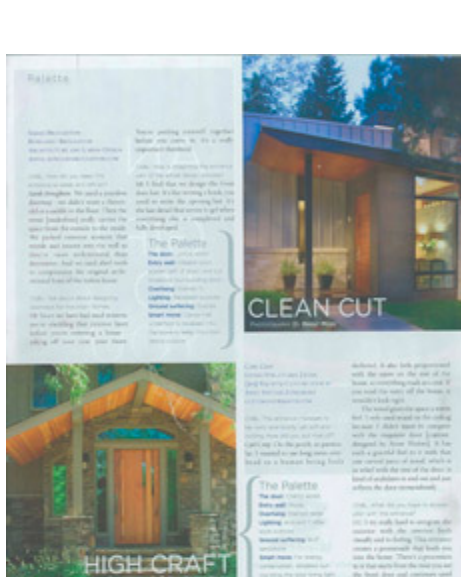
Colorado Homes & Lifestyle