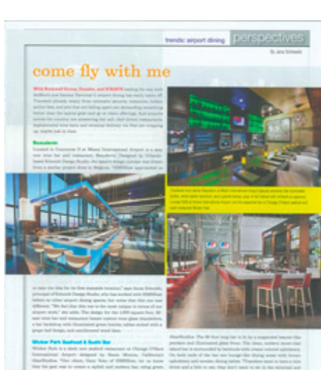
Hospitality Design Magazine