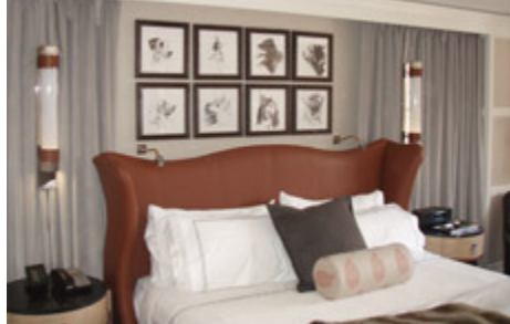
St. Regis Aspen Resort Model Room — Aspen, Colorado