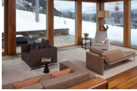
Slope Style Condo — Aspen, Colorado

If you skied Ajax Mountain on Memorial Day Weekend last weekend you may have noticed the newly renovated Slope Style Condo on the Little Nell run. Slope Style Condo is located in the Aspen Alps Condominiums. The Aspen Alps features Aspen's best location - in town and adjacent to the Silver Queen Gondola. Each condo is individually owned and this client/owner retained R+B in order to update the condo with a modern, classy aesthetic that would appeal to them as well as renters.