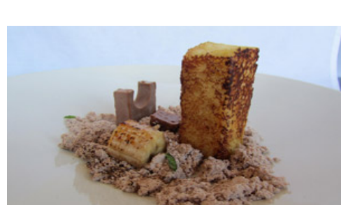
AIA Delicious Designs Aspen Winner - bb's kitchen