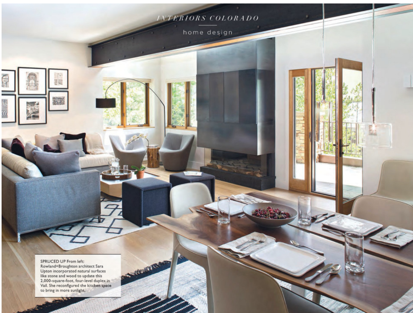
SPRUCED UP From left: Rowland+Broughton architect Sara Upton incorporated natural surfaces like stone and wood to update this 2,000-square-foot, four-level duplex in Vail. She reconfigured the kitchen space to bring in more sunlight.