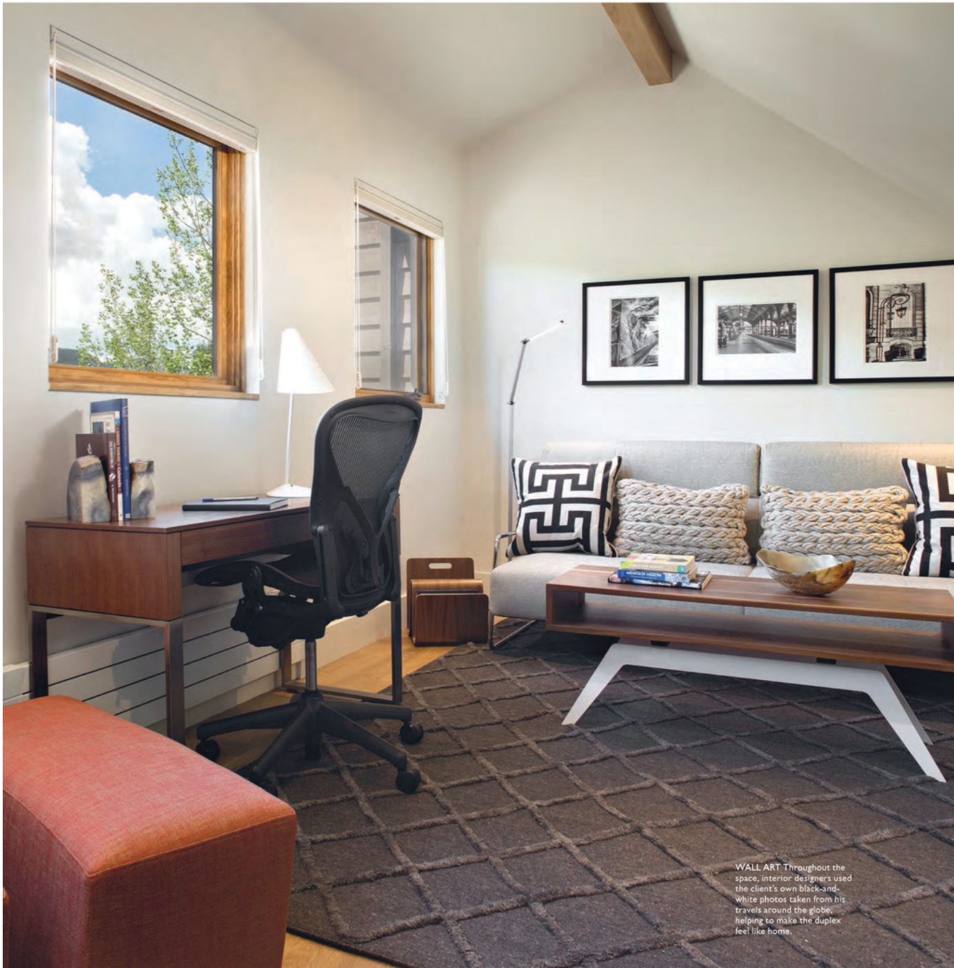
WALL ART Throughout the space, interior designers used the client's own black-and-white photos taken from his travels around the globe, helping to make the duplex feel like home.