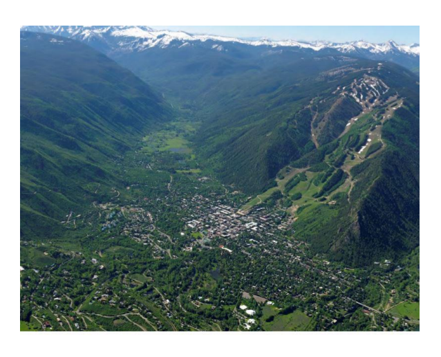
Commercial, Lodging, and Historic District Design Standards and Guidelines

ROWLAND+BROUGHTON ARCHITECTURE / URBAN DESIGN / INTERIOR DESIGN RECEIVES THE AMERICAN PLANNING ASSOCIATION COLORADO MERIT AWARD FOR THE COMMERCIAL DESIGN STANDARDS AND GUIDELINES FOR THE CITY OF ASPEN