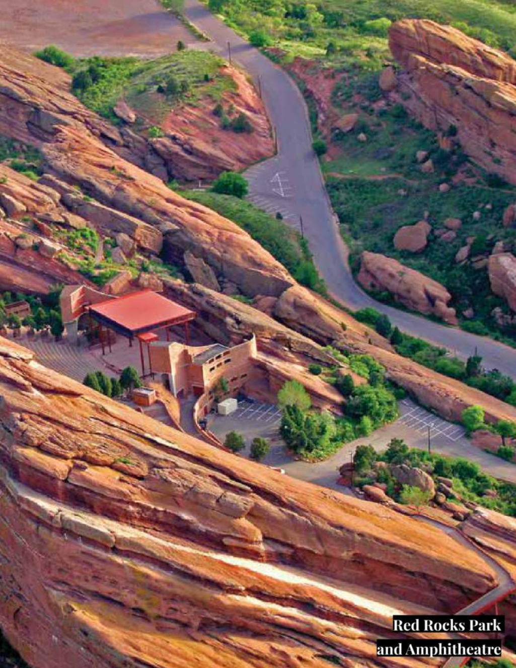
Red Rocks Park and Amphitheatre