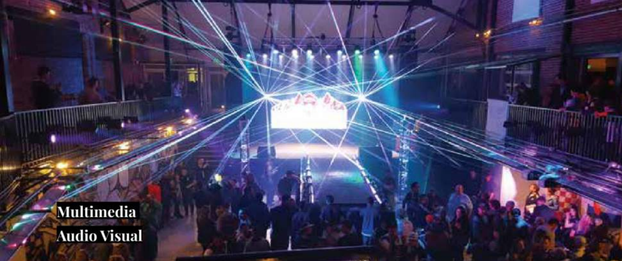
Multimedia Audio Visual