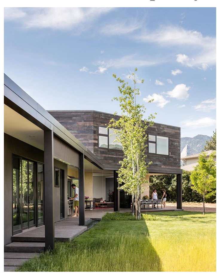
Design by HMH Architecture + Interiors

According to the report, contemporary home style remains popular nationwide, and Colorado is no exception—even in towns like Telluride and Crested Butte, known for their historic Victorian homes and log cabins.