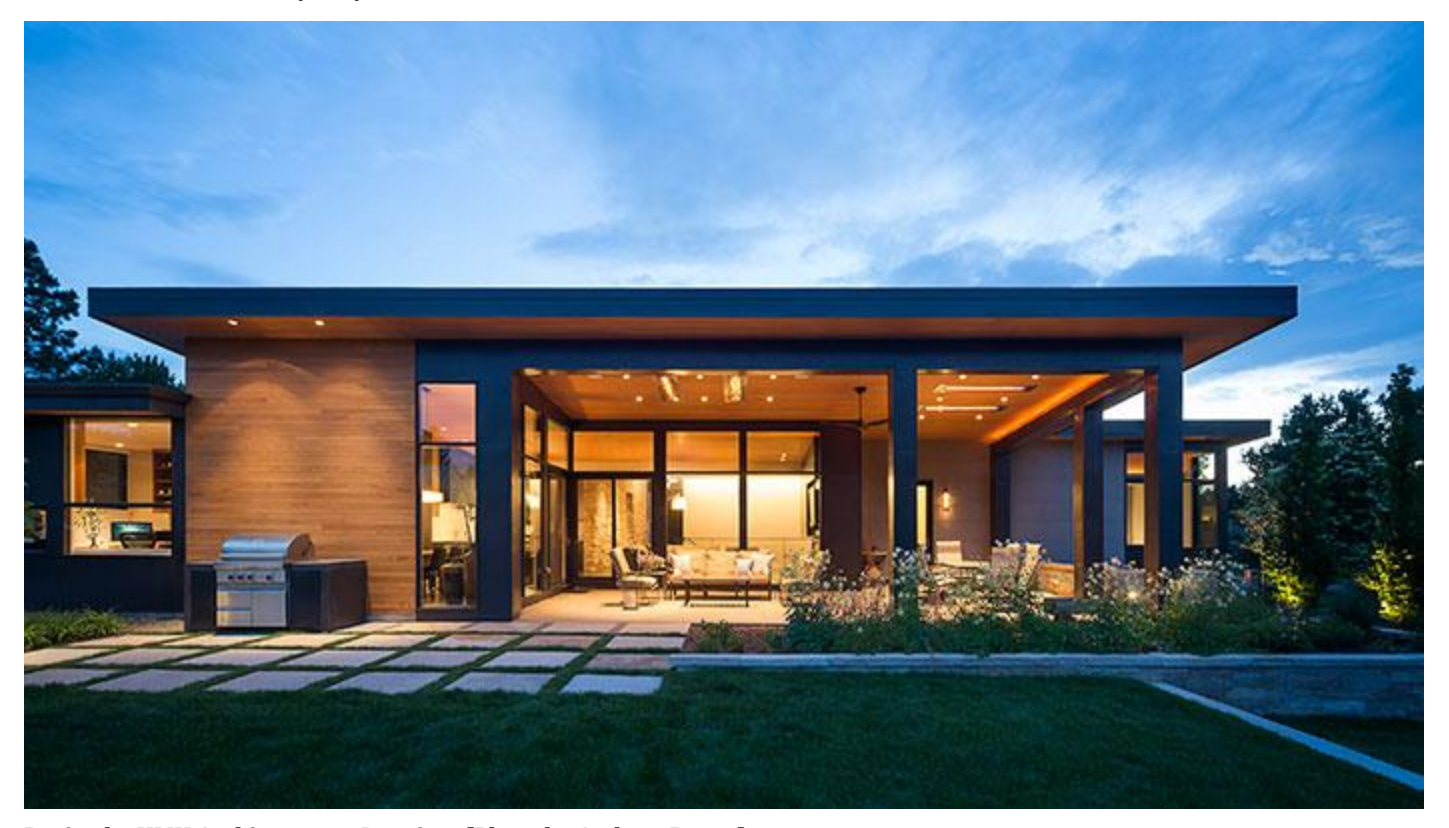
Design by HMH Architecture + Interiors