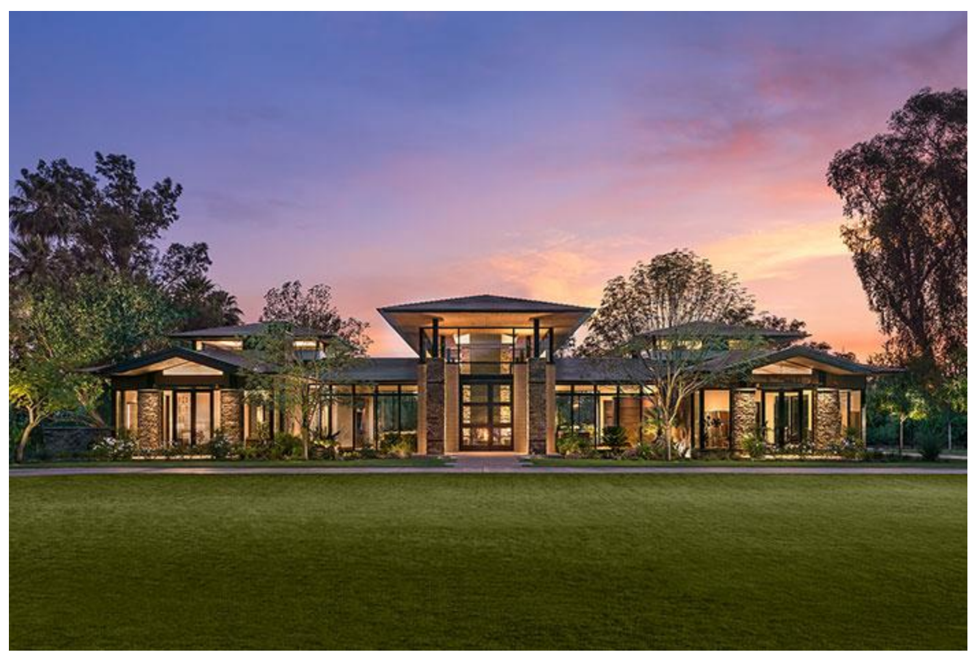
Design by Charles Cunniffe Architects

What's even more popular in the Centennial State is single-story living. "Not many lots [in established communities] are large enough to have all rooms on one floor," Cunniffe says, noting that 'single-story' applies more to the location of the master bedroom; the kitchen, dining room, and master suite are all on the main level, and then secondary rooms can be found above or below. This enables homeowners to age in place without having to address (or redesign due to) major mobility issues.