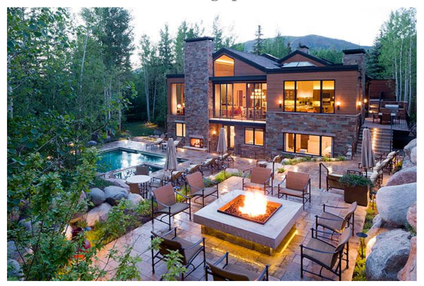
Design by Forum Phi Architecture

While the national report suggests that front and side porches have decreased in popularity, Colorado architects aren't so sure—not because front and side porches are particularly trending, but because there seems to be a greater emphasis on outdoor living spaces in general.