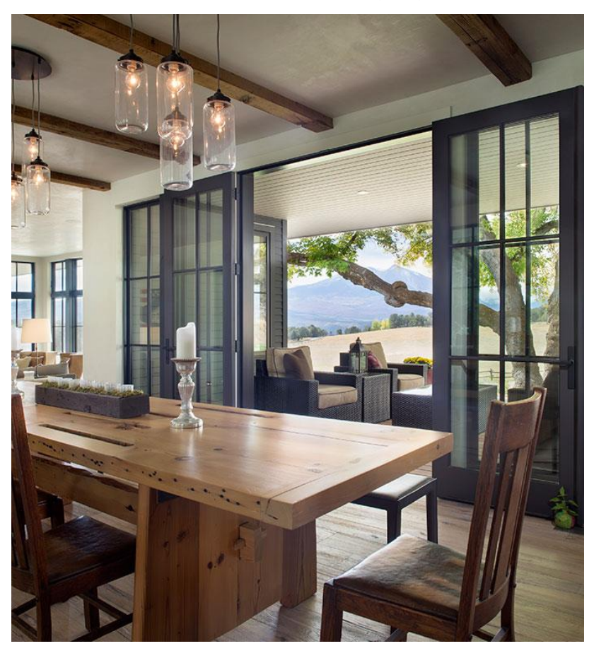
Design by Rowland+Broughton Architecture

Thankfully, Wilson adds, many people are looking for a more cozy and inviting take on contemporary style. "While I think the forms, lines and gestures of contemporary architecture will remain, things are headed toward a warmer, more organic material palette. I also think we're going to start seeing more Colorado materials used in a contemporary way—and I like that direction."