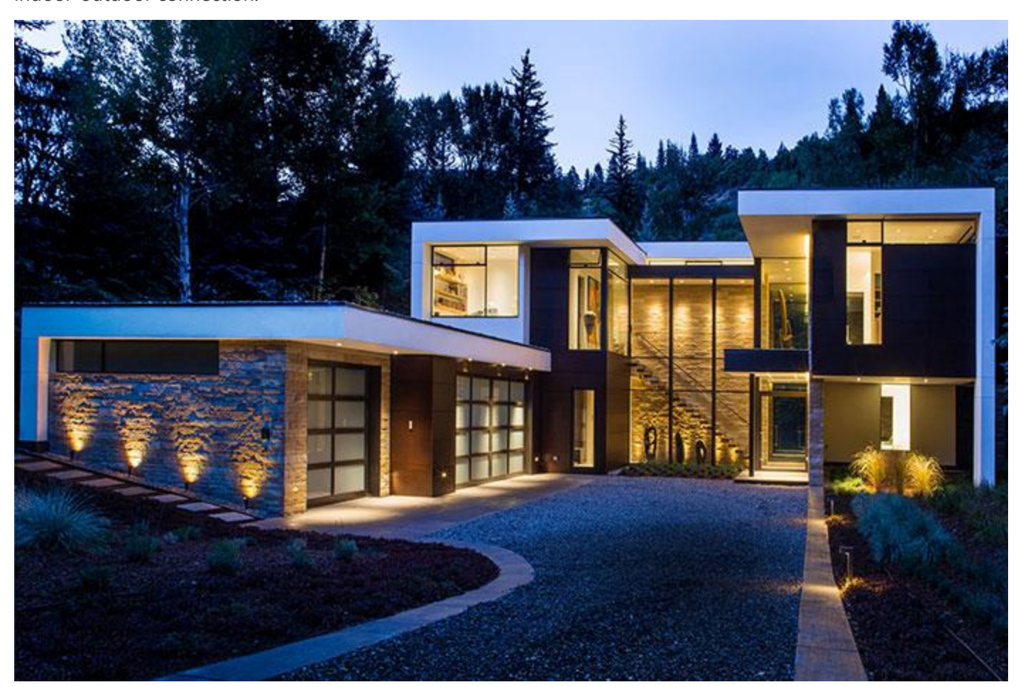
Design by Charles Cunniffe Architects