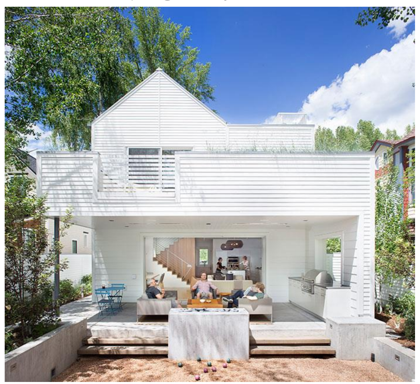
Design by Rowland+Broughton Architecture

Smaller and single-story homes have dipped slightly in popularity on the national scale, but when it comes to square footage in Colorado, there seems to be a stronger interest in quality over quantity.