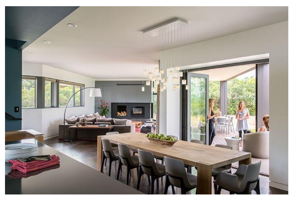
Design by HMH Architecture + Interiors