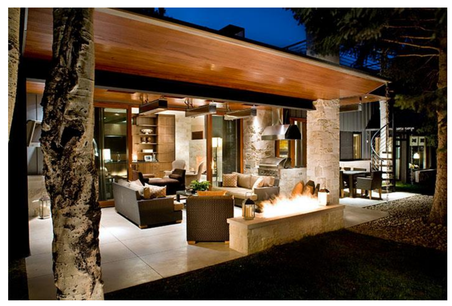
Design by Rowland+Broughton Architecture