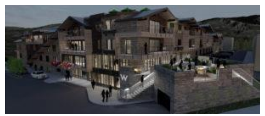
Modern mountain cool is celebrated at Aspen W, which blends the talent and imagination of the W-s in-house design team, Rowland+Broughton, New York-based architects nemaworkshop.