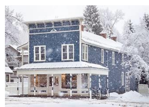
Historic photos courtesy of Aspen Historical Society