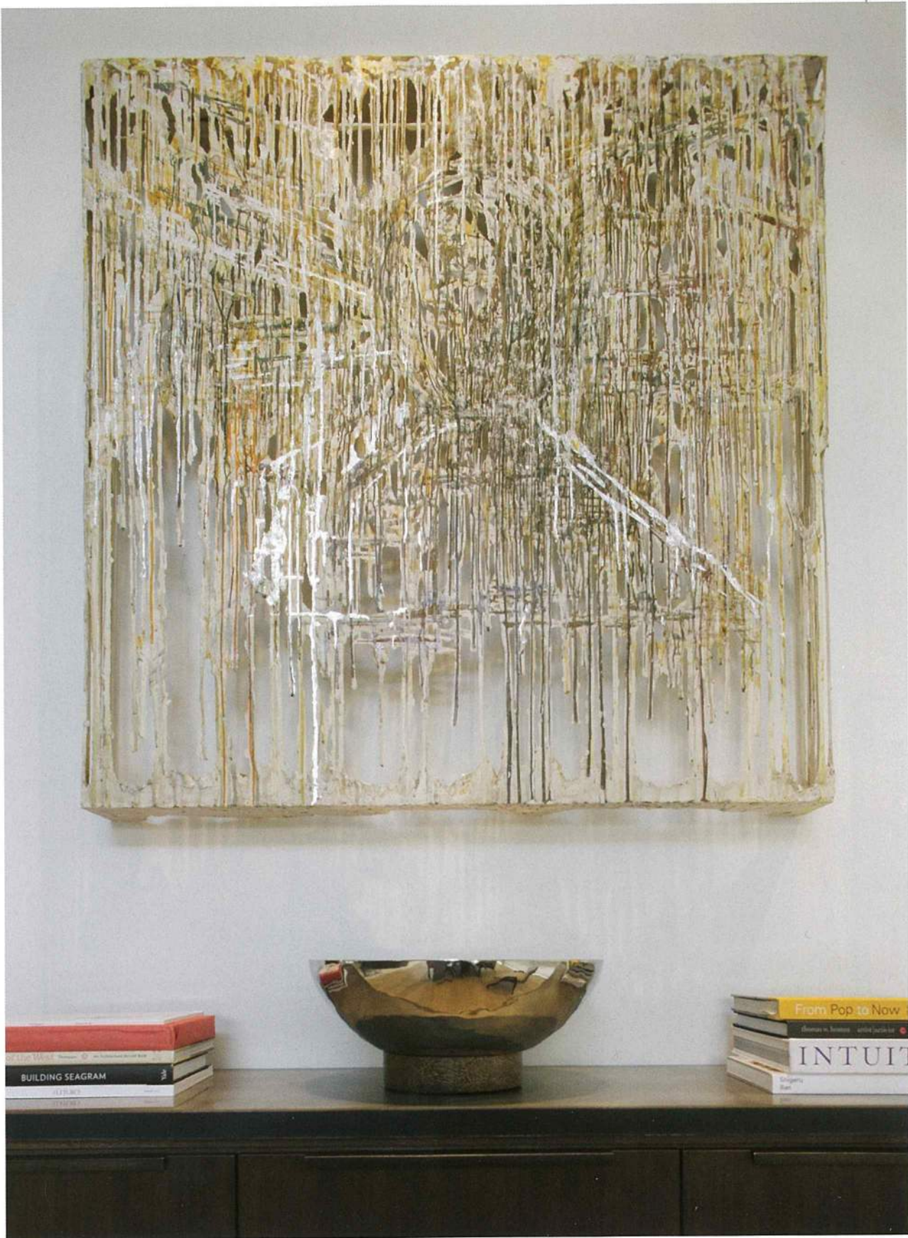
Artwork by Diana Al-Hadid is composed of polymer gypsum, fiberglass, steel, plaster and aluminum leaf and hangs above a custom console in the dining room. The latter is a combination of rift-sawn walnut cabinetry by Benchcraft and a zinc-encased resin top by Wüd Furniture Design.