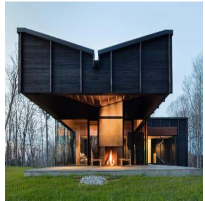
Desai Chia Architecture