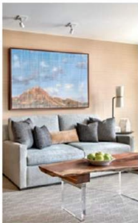
The Viceroy's newly furnished rooms