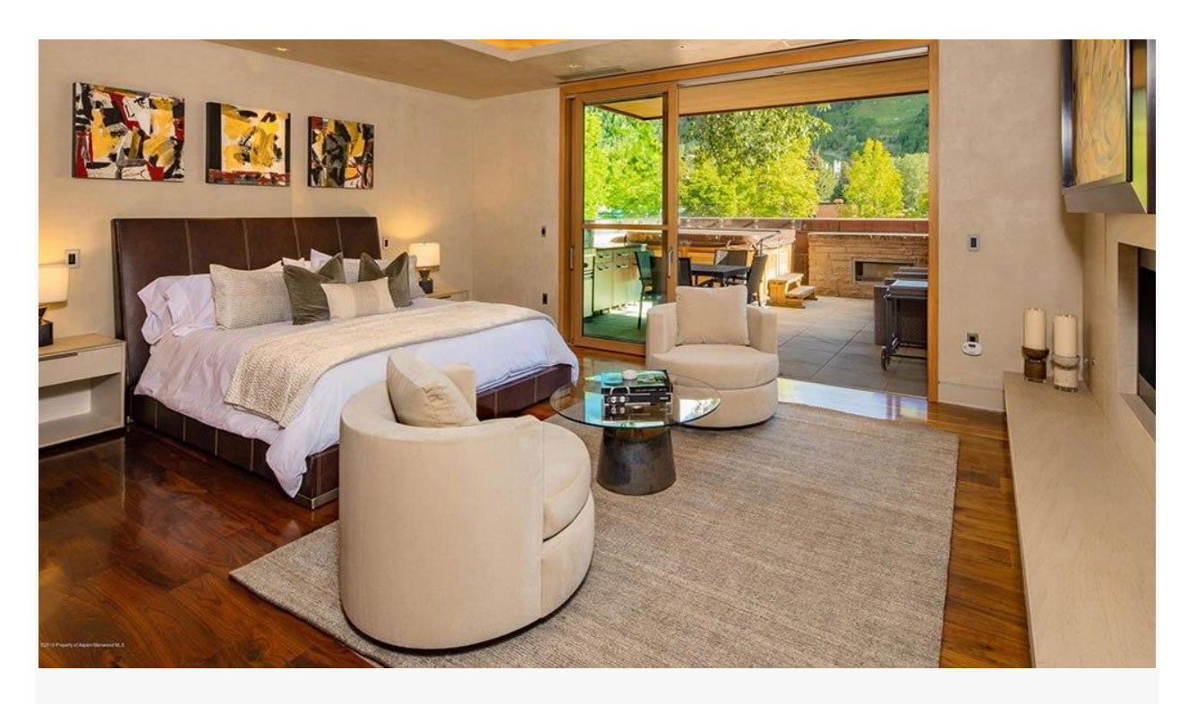
The master suite

The huge second-floor living area features an open-plan layout with professional-grade kitchen, dining area, family room with fireplace, and floor-to-ceiling glass doors leading out on to a large terrace with more jaw-dropping mountain views.