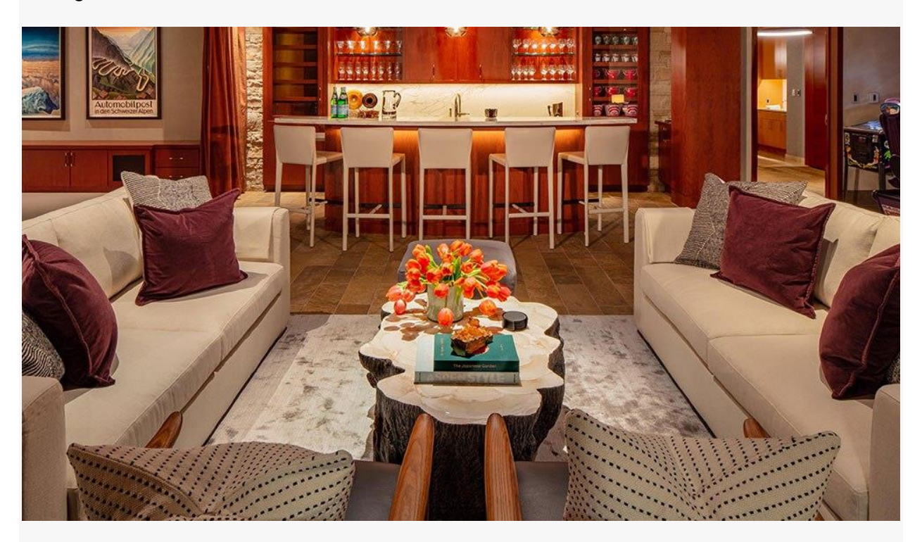
The bar opens up to the living space.

As part of the Edgerley's remodel, they created a quite-amazing basement R&R space that features a 10-seat movie theater, huge bar and sofa-filled relaxation area, a large fitness room, massage room, pool table and mini amusement arcade with pin ball machines and driving simulators.