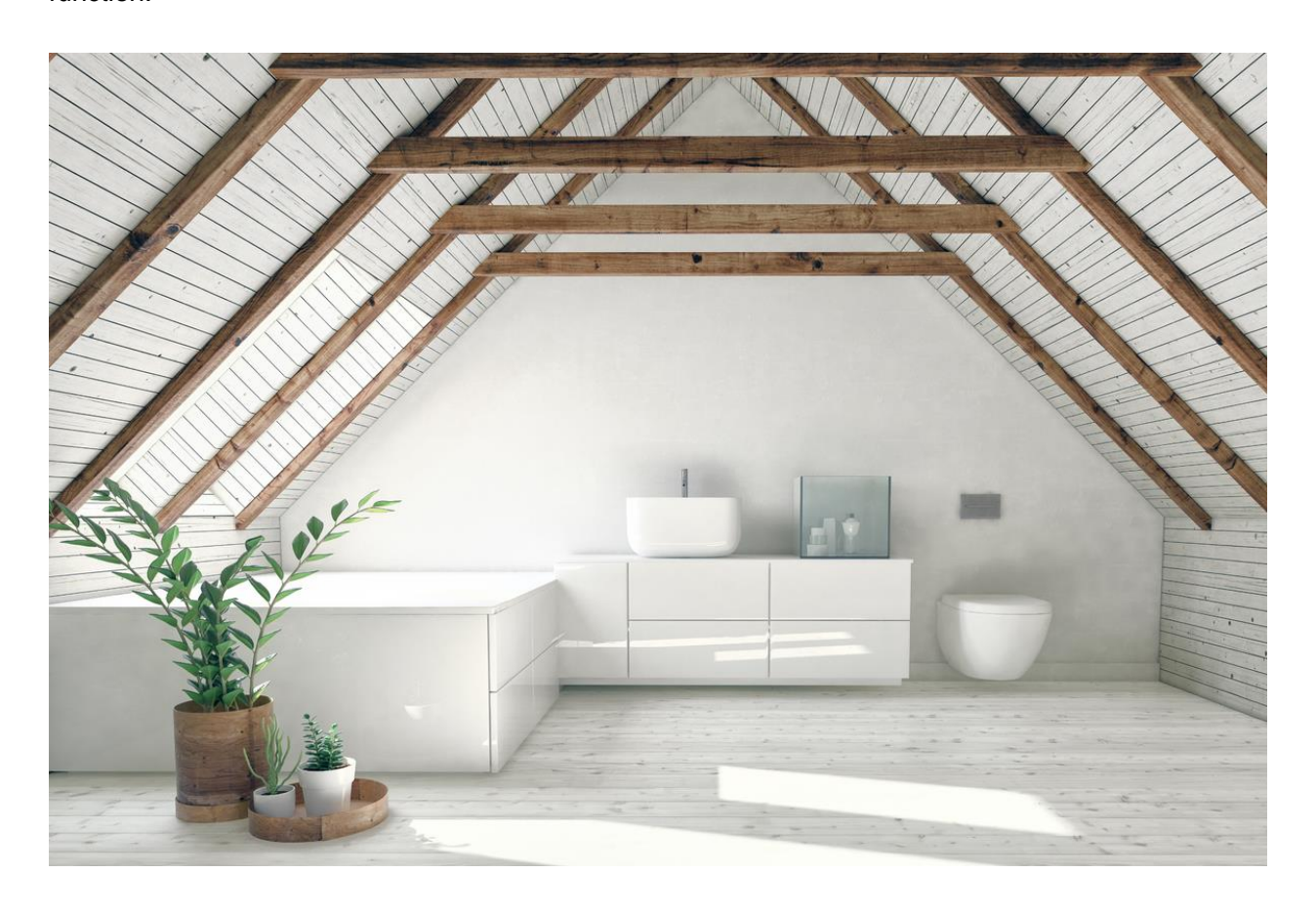
A Dim Warehouse-Style Loft Transformed

This historic building in on the Spanish Island of Mallorca was renovated into a complex of 12 individual apartments. Each apartment has its own design, says <a href="Danielle de Lange">Danielle de Lange</a>, owner of The Style Files. One apartment's master bedroom opens up onto a doorless bathroom. The open space with a modern shower, gorgeous floating vanity and neutral tones is a beautiful example of minimalism. The large amount of closet space with sharp lines adds to the minimalist design and function.