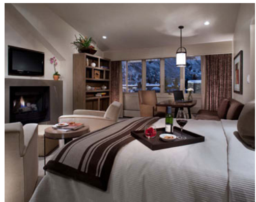
The Little Nell - Aspen, CO