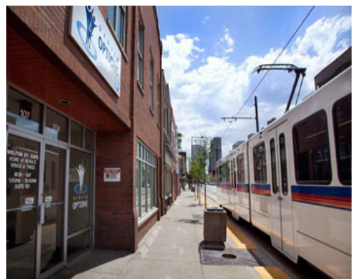
Denver Options - Denver, CO

This will be R+B's third project with Denver Options. The two previous projects include Denver Options 360 completed in October 2009 and the main offices of Denver Options in 2005. For more information on Denver Options go to www.denveroptions.com .