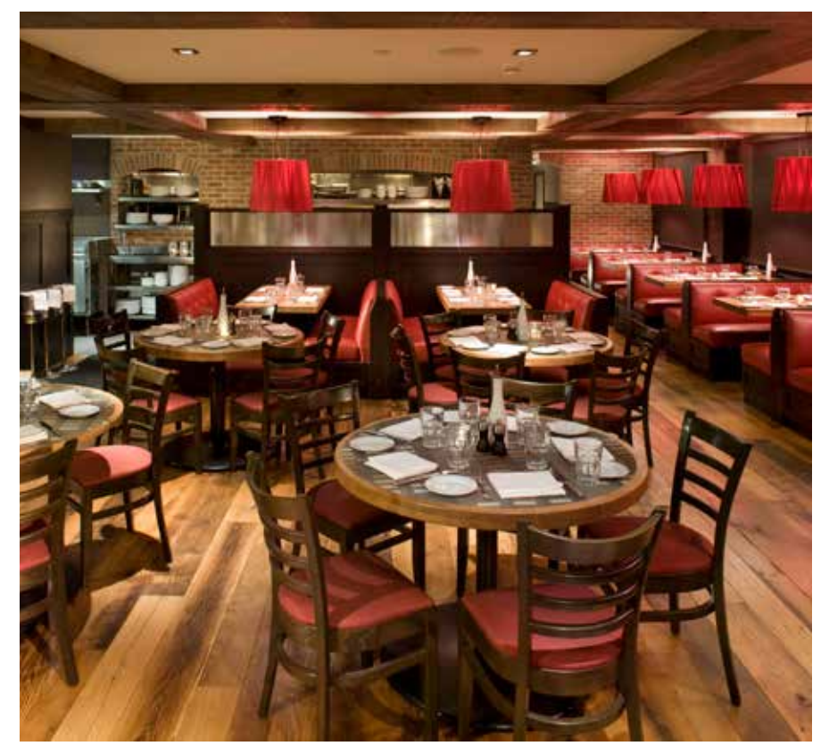
Size: 2,640 square feet

Situated at the base of Aspen Mountain, this famous après ski haunt at The Little Nell hotel began its existence as Schlomo's in 1989. In 1994 the restaurant underwent an extensive renovation to become Ajax Tavern. In its new incarnation, Ajax Tavern is open for lunch, après ski, dinner, as well as special events. The design relocates the bar, expands banquette seating and adds architectural details. Updated finishes and materials bring the space into present day, while retaining the traditional tavern feel. Red is the predominant hue, accented by deep brown wood finishes. The space is enriched with brick masonry, leather upholstery, refurbished millwork and reclaimed oak floors. A series of drum shade pendants, hand-wrapped in red ribbon, define each booth. The interior design reflects a classic tavern aesthetic with a modern sensible feel, transcending time and design trends.