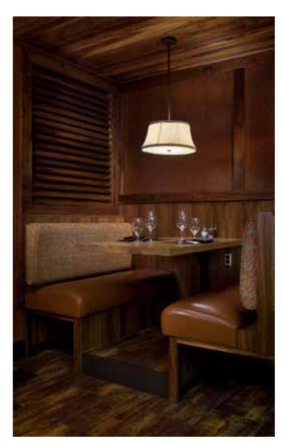
rowland+broughton architecture / urban design / interior design