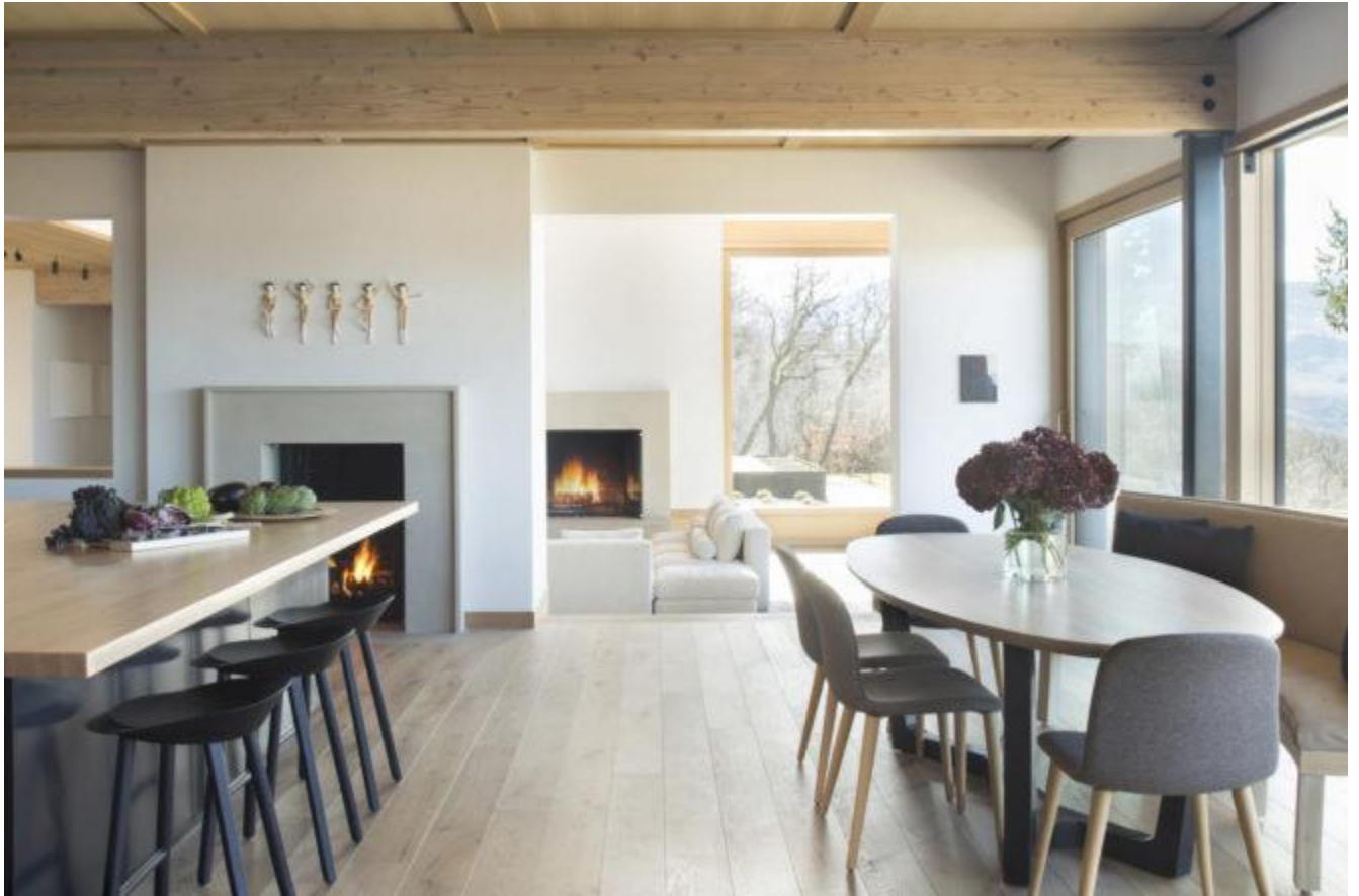
Open plan with a couple of open fires

The house encompasses 8,250 square feet and is constructed along the central spine of communal areas. The south of the house contains an expansive master bedroom suite with an original wood-burning stove, which has been restored from the original 1960s construction.