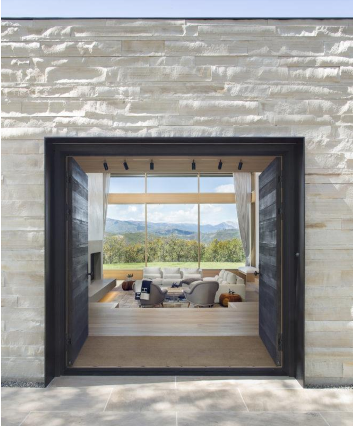
Being greeted with a view