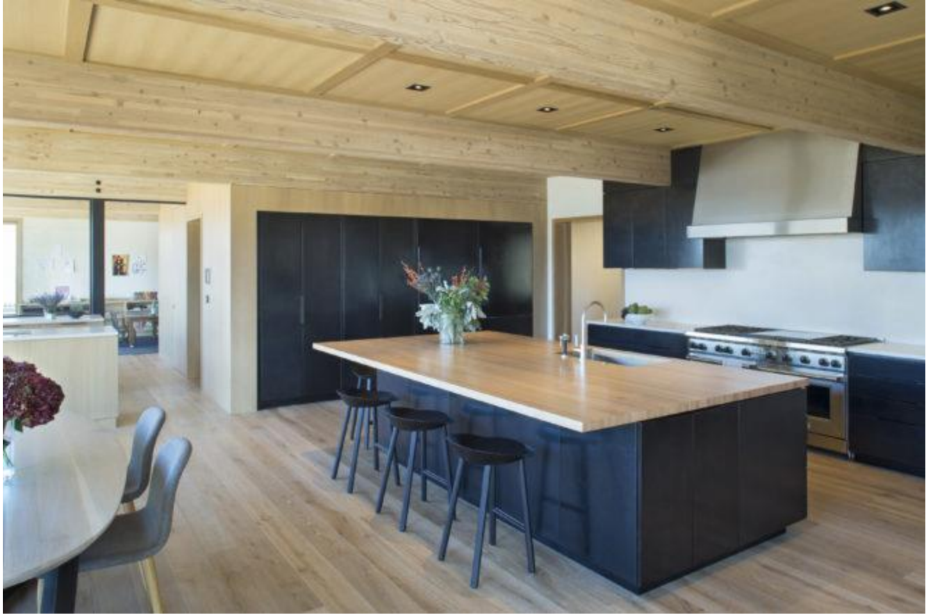
A kitchen that's always photo-ready

The kitchen features a cosy fireplace, stainless steel appliances and dark contrasting cabinets. Step down from here into the living area and you'll find a stone fireplace with a built-in wood store. This not only acts as a centrepiece but also comes in very handy on the cold Colorado winter nights.