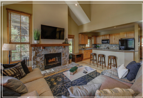
27 GOLDEN BENCH | TURNKEY TOWNHOME 3 BEDROOM / 3 BATH • 1,640 SF • $679,900