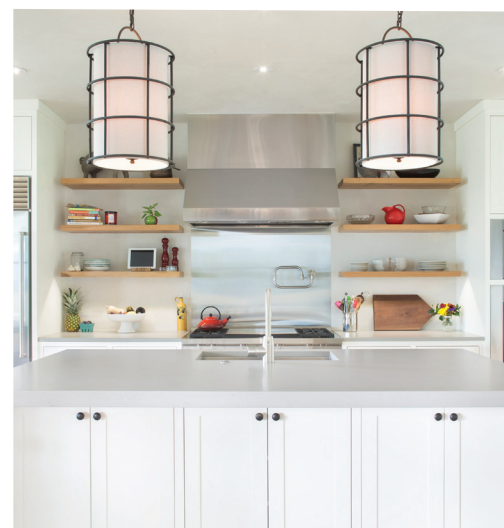
LEFT: The kitchen and dining area is a comfortable gathering place for the family. Oak flooring runs throughout the home, connecting all the spaces in a consistent and subtle way. BELOW (top): The dining space opens to the outdoor sitting area to take advantage of the setting. BELOW (bottom): Custom cabinets in the kitchen are by Benchcraft Custom Woodwork; the countertop is Balentine by CaesarStone Raw Concrete, and Troy Liberty Rust Haven pendant lights hang above the island. OPPOSITE: This single-level ranch-style home is set on an expansive lot in Carbondale, Colorado, with mature trees and creek beds that dictated siting. The result? Harmony between structure and setting.

theory (1755) asserting that the ideal architectural forms stem from man's relationship to nature, the home is elegant yet simple and honors the natural landscape surrounding it.