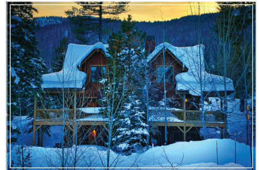
29 GOLDEN BAR | SKI ACCESS TOWNHOME 2 BEDROOM / 3 BATH • 1,407 SF • $625,000

Tamarack Realty is an exclusive full-service brokerage company located onsite at Tamarack Resort. Our friendly, knowledgeable sales associates will happily listen to both your dreams and your needs, and then help you find the perfect home to fulfill both—whether that's an Estate Home, Condominium, Townhome, Estate Lot, Cottage, or Chalet. Now offering The Village at Tamarack luxury residences starting in the mid $500Ks.