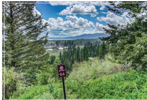
SKI IN SKI OUT HOMESITES PRICES STARTING AT $250,000