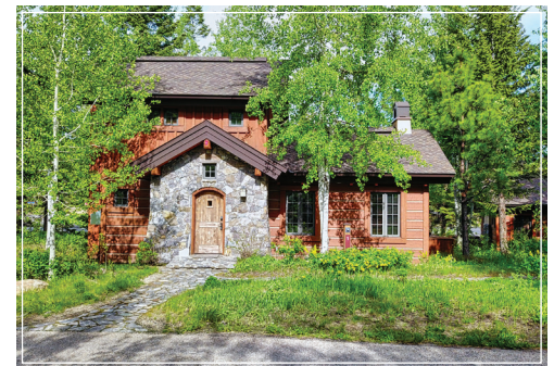
1 ROCK CREEK | COTTAGE IN THE HEART OF TAMARACK 2 BEDROOM / 2.5 BATH • 1,250 SF • $699,000