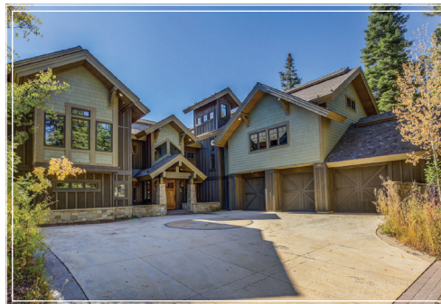
63 COUNCIL | THEATER, WINE CELLAR, PILOT'S QUARTERS 4 BEDROOMS / 8 BATH • 6,870 SF • $2,267,100