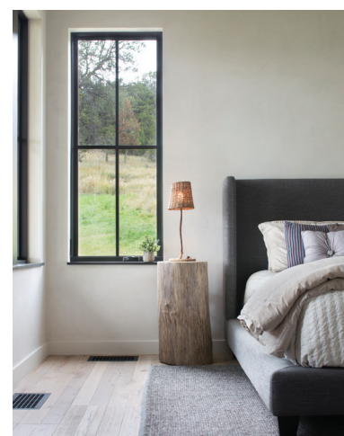
ABOVE: The master bedroom looks out towards the mountains and is simple and clean, blending natural elements with contemporary stylings. RIGHT: A guest room offers views, privacy, and peace. BELOW: The floor plan is open with a natural flow from space to space that reflects the way the family lives.