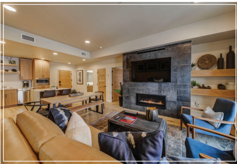
VILLAGE AT TAMARACK | UNIT 202 2 BEDROOM / 2 BATH LUXURY CONDO • 1,384 SF • $999,000

Begin your legacy at this premier, four-season Alpine mountain community in the heart of the renowned Tamarack Resort.