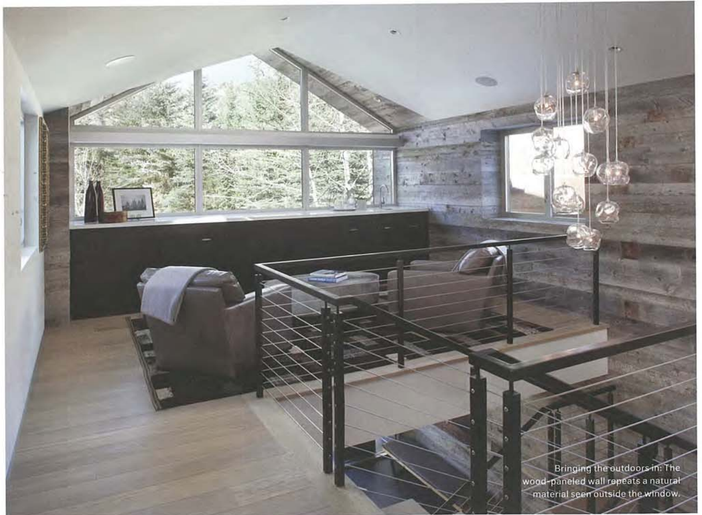
Bringing the outdoors in: The wood-paneled wall repeats a natural material seen outside the window.