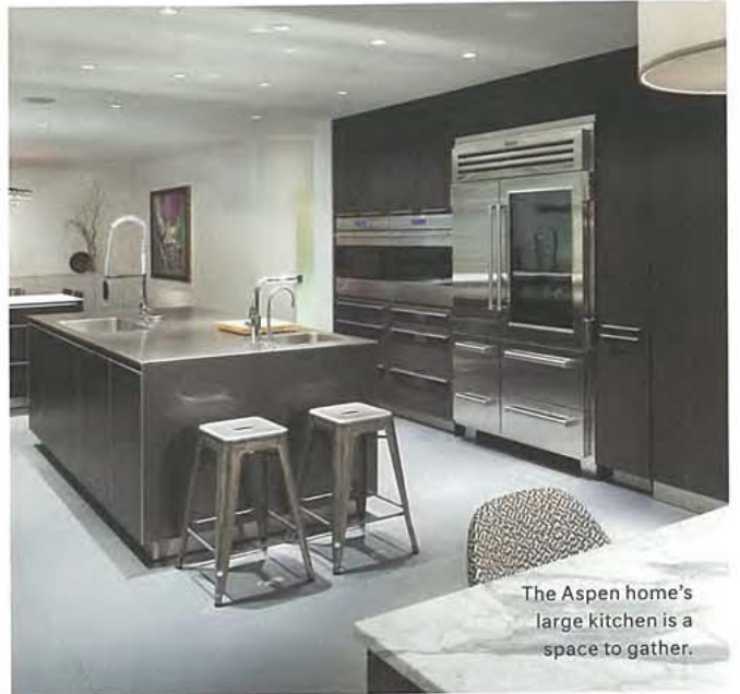
The Aspen home's large kitchen is a space to gather.