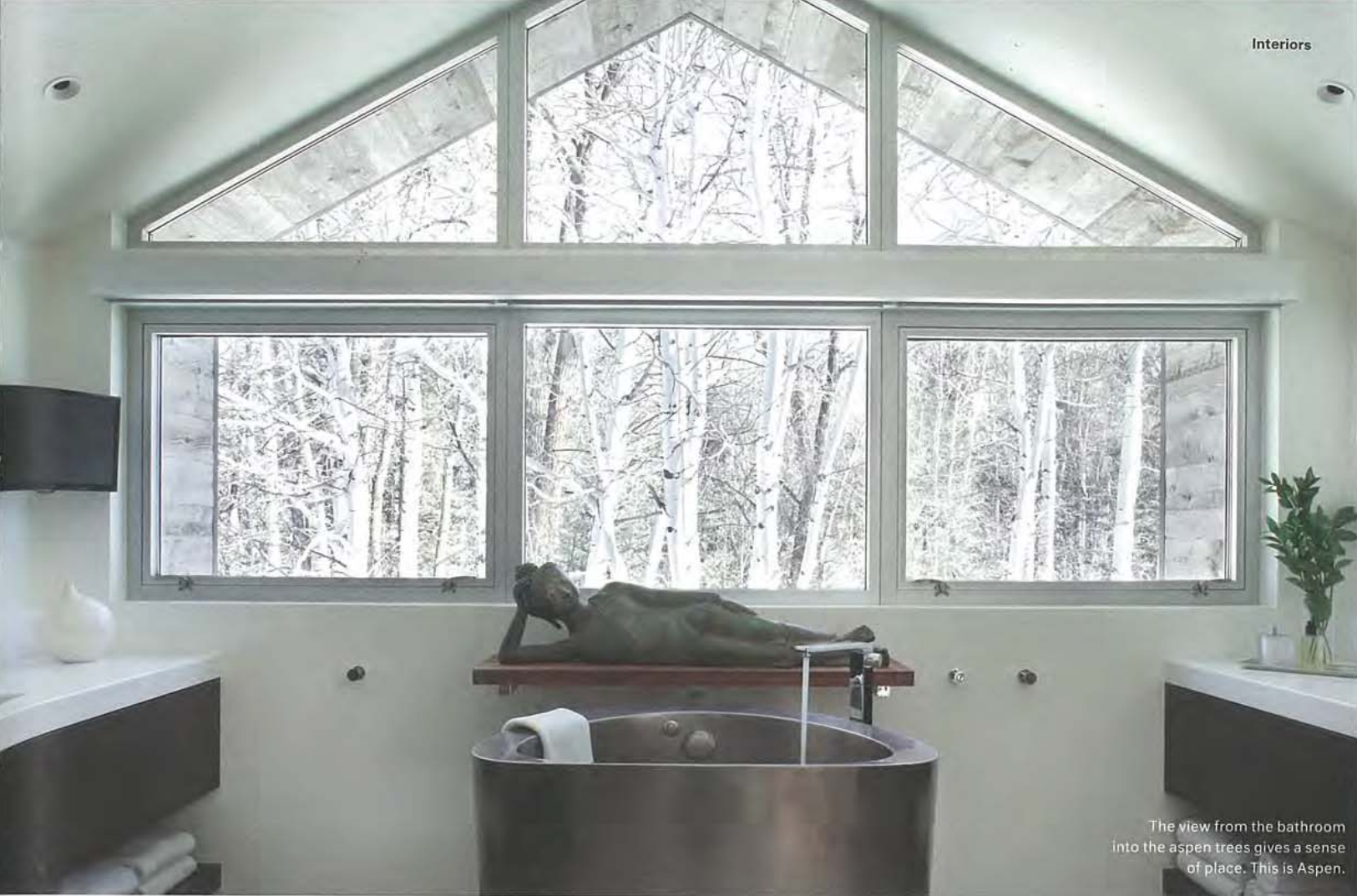
The view from the bathroom into the aspen trees gives a sense of place. This is Aspen.

forest's canopies, for instance, can translate into a pattern. Twinkling lights become reminiscent of a starry winter night in the Rocky Mountains.