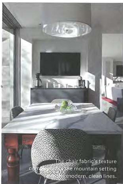
The chair fabric's texture contrasts with the mountain setting's modern, clean lines.

With its clean-lined, minimal design, Black Birch Modern in Aspen is an example of a mountain retreat that not only boasts stunning alpine-modern architecture, but is warm and welcoming to boot. R+B achieved this balancing act by bringing outdoor materials inside. That, Broughton believes, is something anyone can do at home. "Carrying a material found around the outside of the house into the flooring, for example, is an effective way to blur that indoor-outdoor line, which is such a quintessential element of