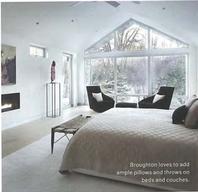
Broughton loves to add ample pillows and throws on beds and couches.